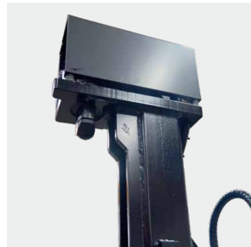
Improved design with built-in cabling and larger bending radius for hydraulic hose between pocket and end-post.